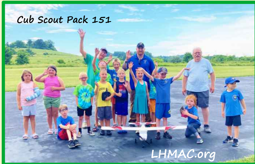
Cub Scout Pack 151