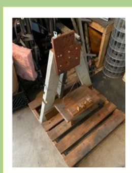
Engine Test Stand