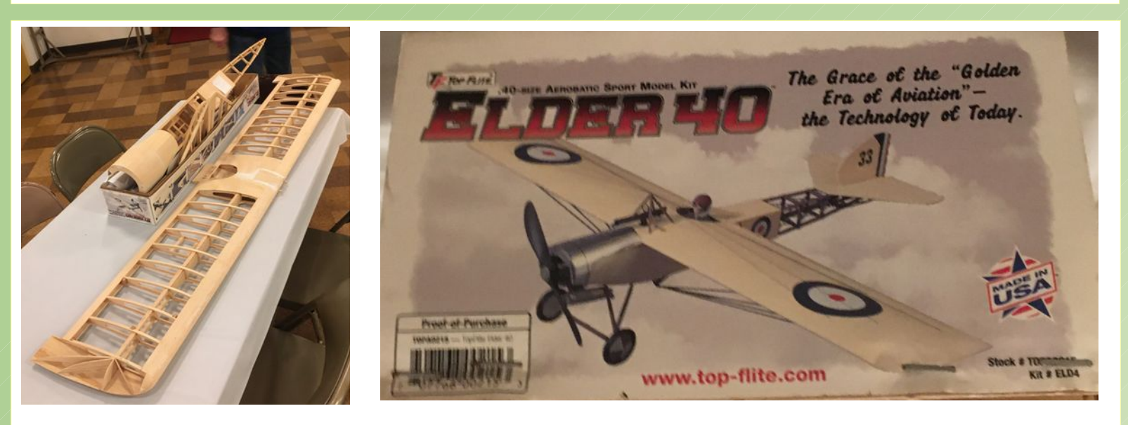
Elder 40, 90% complete, Many extras! $70.00