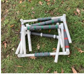
PVC Stand for SUV or Van Breaks down