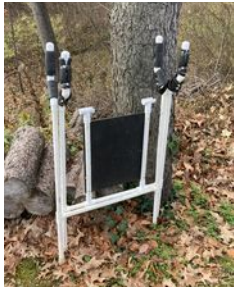
Folding PVC Field stand