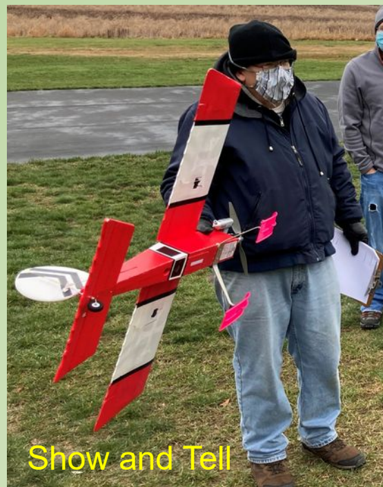
Show and Tell