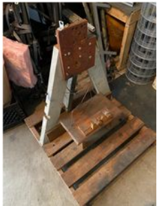
Engine Test Stand