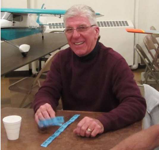
The meeting was adjourned at 8:46 PM.